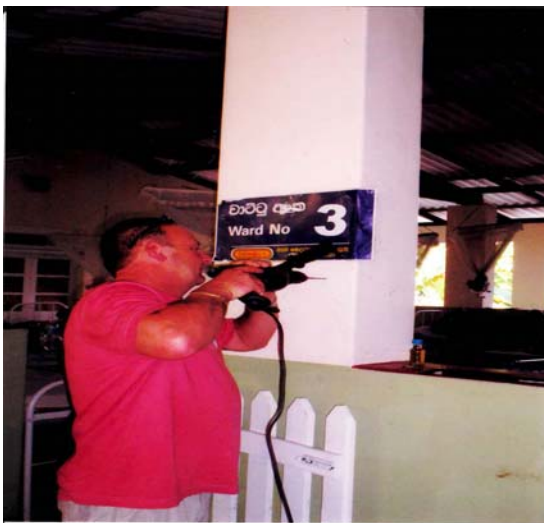
The sign for the maternity Labour Room is fitted and renamed 'Kniveton Ward'

In gratitude of this, the hospital wards were named after local Derbyshire Dales Villages.