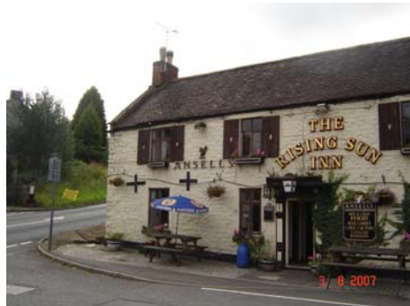
7pm Friday 14 th November 2008

A week on a narrow boat for up to four persons